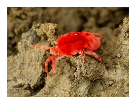
Fig. 4: Trombidium grandissimum