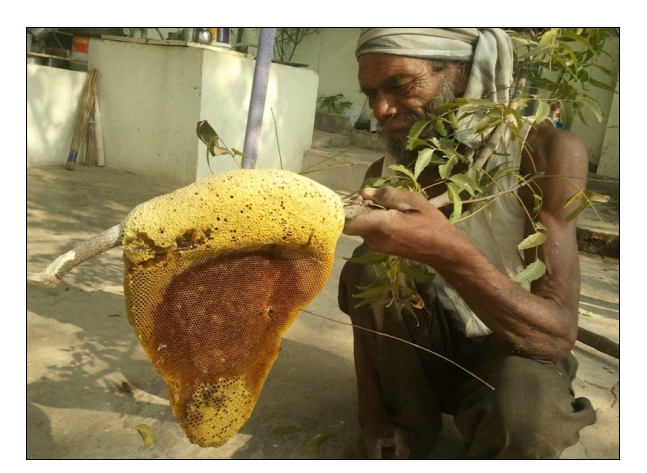
Figure-3 Hive of Apis spp.