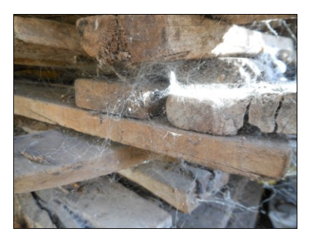
Fig 6: Web of Arenea spp.

Pheretima posthuma is used for lactation by delivered lady, in this area but the ground animal used for high fever due to measles and chicken pox by Tamang people of Central Nepal also used for wounds, cough, jaundice and pain by tribes of Attappadi hills of Western Ghat. (Lohani 2010; Padmnabhan and Sujana 2008). The Hirudinaria medicinalis is used for ulcer, in this area but animal ash is used as sexual stimulant, Pharyngitis and piles by people of Western Ghat and South India (Dixit et al., 2010). Lac powder of Lacifer lacca, is used for leucorrhea but powder of animal is used for bone fracture by people of South India, (Dixit et al. 2010). Cimex lactuarius is used for fit in this area also used by people of South India (Dixit et al., 2010), but it is used in epilepsy, piles, alopecia and urinary disorders by people of Chhatisgarh (Oudhia 2003). Lyciosa tarantula web is used for stop bleeding in this area but it is used for aphrodisiac, muscular dystrophy by people of South India (Dixit et al., 2010). Cancer pagurus is used joint pain (rheumatism) is also reported tribes in Attappadi hills of western Ghats and Saharia tribes of Rajasthan, roasted animal used for sharpen memory by Tamang people of Central Nepal, whole body for Jaundice and other liver disorders by tribes of Nagaland (Padmnabhan and Sujana 2008; Mahawar and Jaroli 2007; Lohani 2010; Kakati et al.,