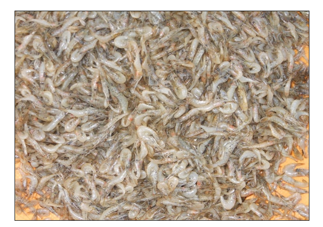
Fig. 2, Bunch of Macrobranchium spp,