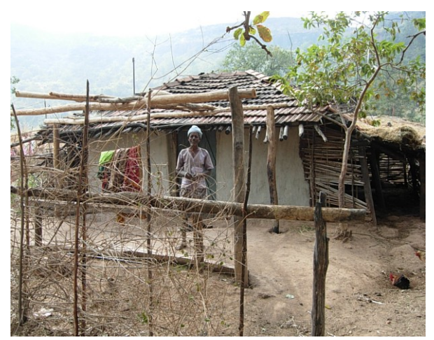
Fig.1: Picture of Mawasi Man, (Photo: Neelima Bagde)

The Mawasi Tribe: They are traditionally a nomadic community and speak mawasi boli. Mawasi are generally shy, honest and laborious. They are very cooperative in nature and peace loving people. The economic condition of the tribes is not good. Agriculture, animal husbandry, poultry forming and laboring are source of income. They also collect gum, traditional medicine and honey and sale to generate income. The life of the people is full of traditions and social customs from birth to death owning to outdated customs not attuned to remain competitive in the current economic scenario of privatization. Due to living in remote areas traditional culture large number of family member and poverty their children are not able to take even primary education, only 5-10% children get primary education, higher education