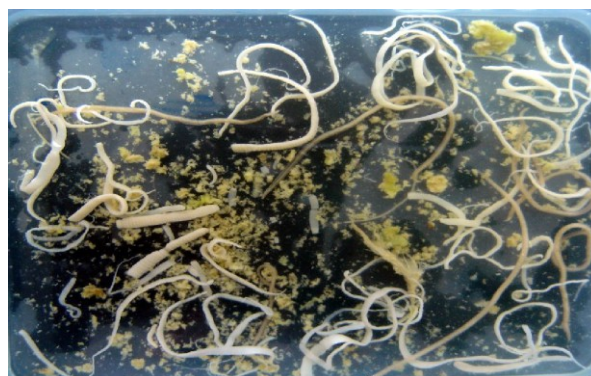
Fig.2. Intestinal Contents showing Nematode and Cestode parasite.