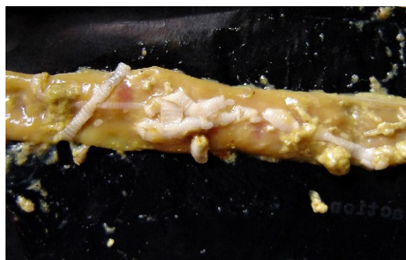
Fig.1. Tapeworm embedded on the intestinal mucosa