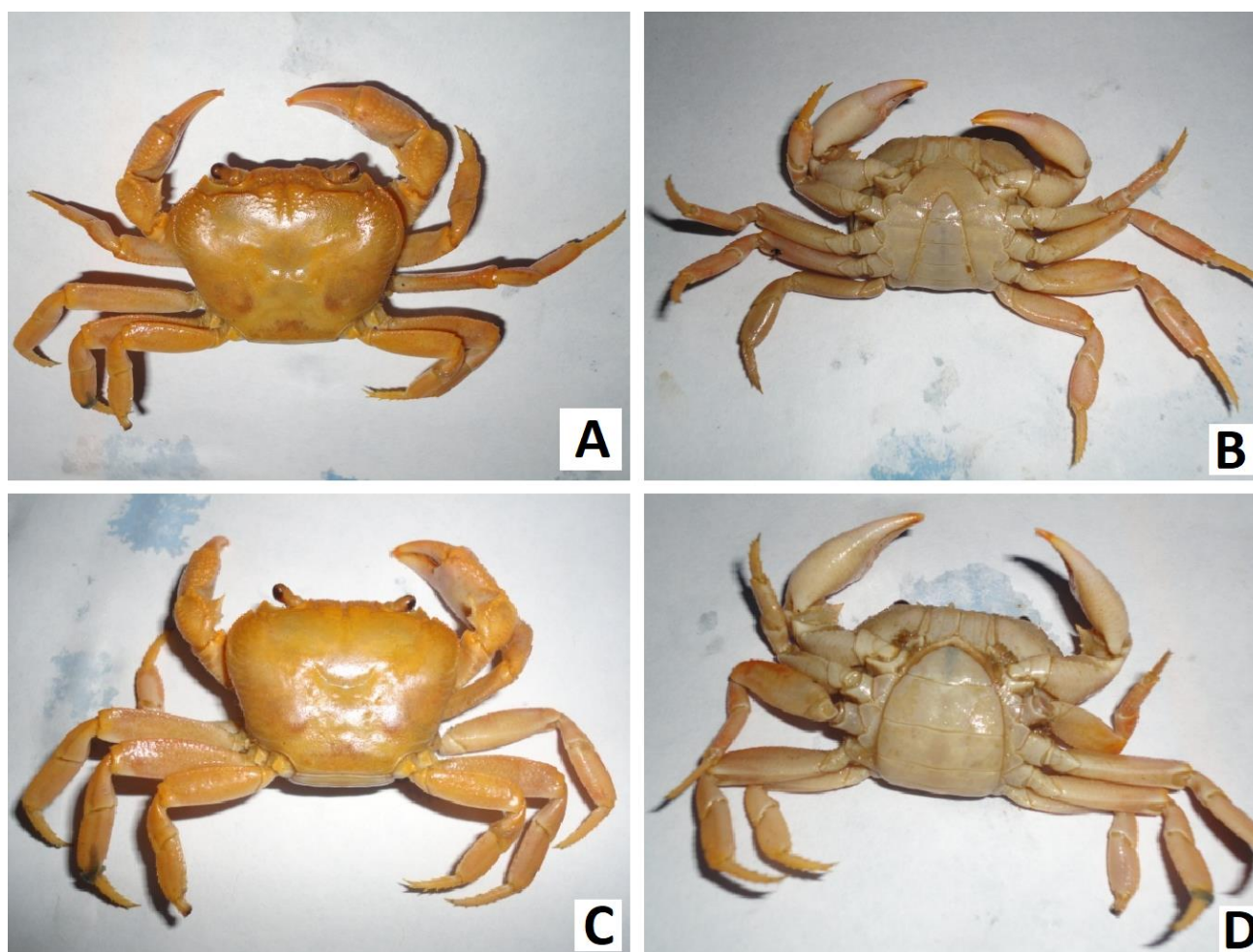
Figure 1: Himalayapotamon atkinsonianum (Wood-Mason, 1871) A: Male (Dorsal) B: Male (Ventral) C: Female (Dorsal) D: Female (Ventral)

Heterochelous Chela: Heterochelous Chelas equipped with teeth observed in both the sexes. The male crabs recorded heavy and bigger size chelipeds as compared to females. Black or Dark brown in colour