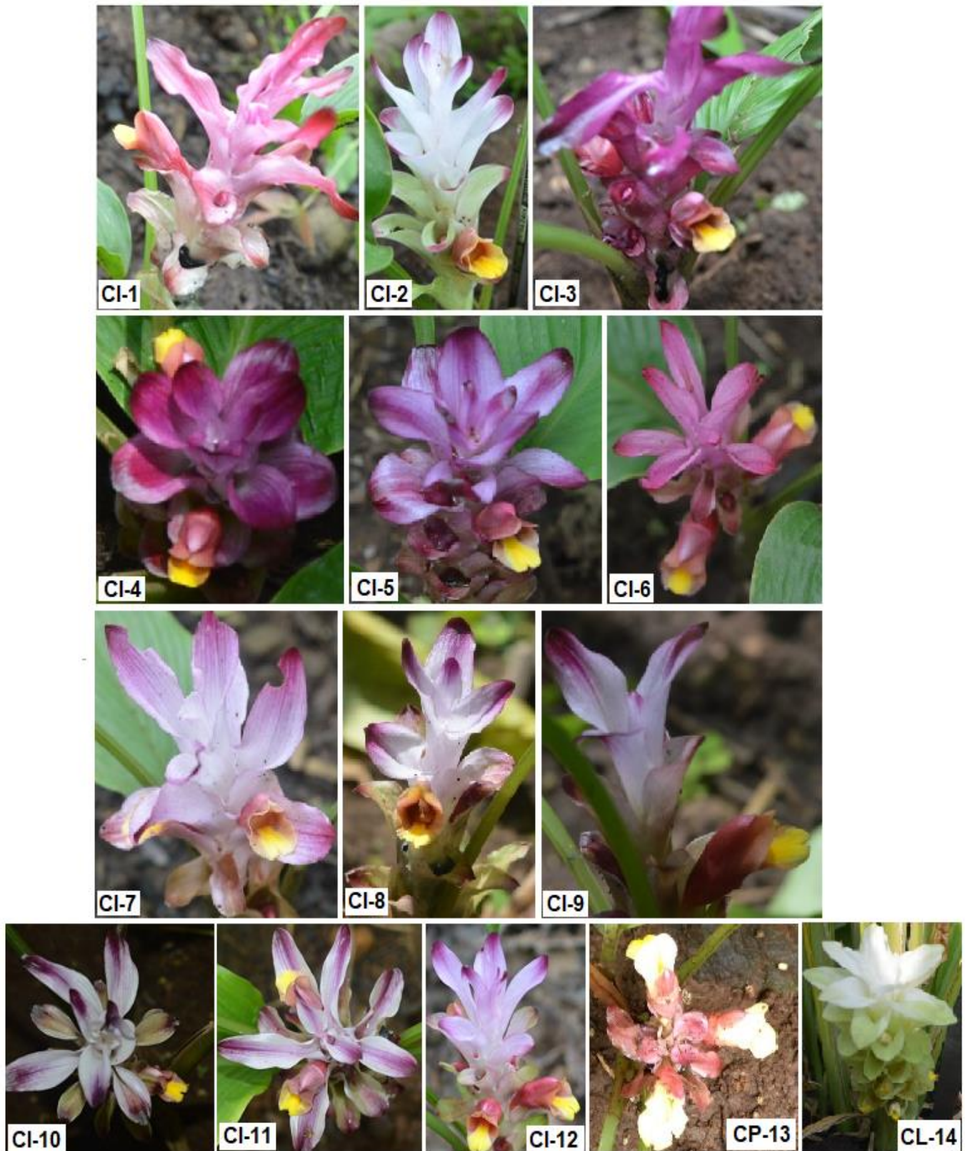
Photoplate 1: Curcuma accessions